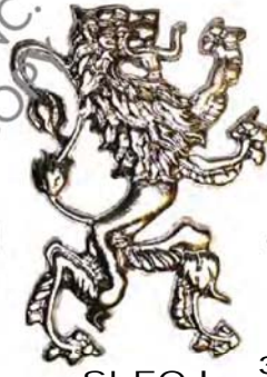
30 SLEO-L 8" x 10-1/2"