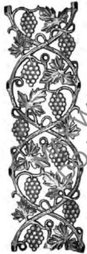
119 10 7-3/4" x 26-1/2"