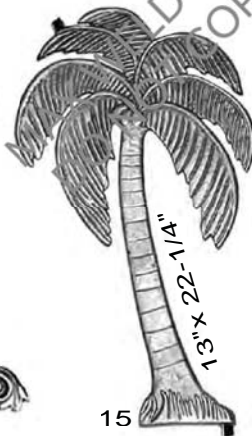
15 BAP-L/R 13" x 22-1/2" 4-1/4"