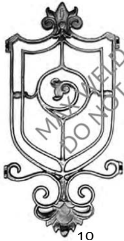
10 146 11"x 22-1/2"