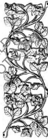
113 15 7" x 21"