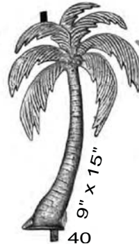
40 SAP-L/R 9" x 15"