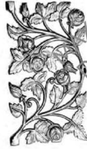
102 20 8" x 13-1/2"