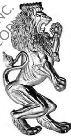
10 LEO-L 10" x 20"