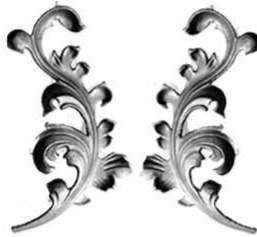
1.56 Lbs. 20 4144L/R 11-1/2"x4-3/4"