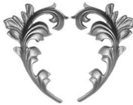
1.1 Lbs. 20 4145L/R 5-1/8"x8-5/8"