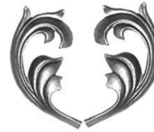
0.38 Lbs. 50 4146L/R 2-3/4"x5-3/4"