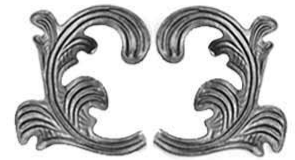
1.46 Lbs. 20 4150L/R 6-3/4"x6-1/2"