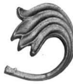
0.25 Lbs. 100 4141L/R 3-1/4"x2"