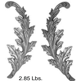
2.85 Lbs. 20 4157L/R 15"x7-1/2"