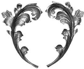
1.2 Lbs. 20 4143L/R 9-5/8" x 5-3/4"