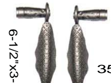
6-1/2"x3-1/4" 0.72 Lbs. 35 4261