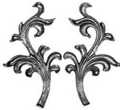
2.3 Lbs. 25 4140L/R 9"x 5-1/8"