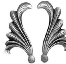
0.8 Lbs. 50 4156L/R 4"x7-3/4"