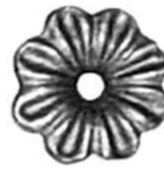
0.17 Lbs. 200 4154 R 2-3/8"