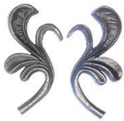
0.31 Lbs. 70 4139L/R 2-1/2" X 5"

11099 Rush Street, South El Monte, CA 91733 Tel: 626-444-1500 | 626-444-1509 www.maxweld.com | maxweldinc@yahoo.com