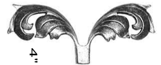
4" x 8" 0.77 Lbs. 25 4166