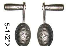
5-1/2"x3-1/4" 0.65 Lbs. 35 4262